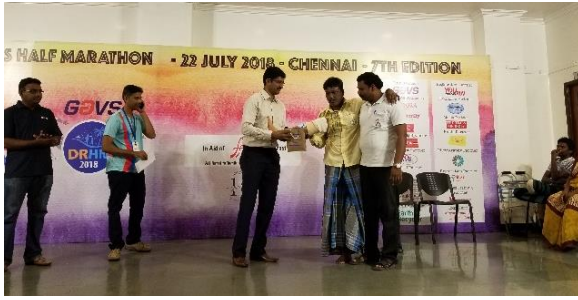
Dream Runners Foundation – Chennai