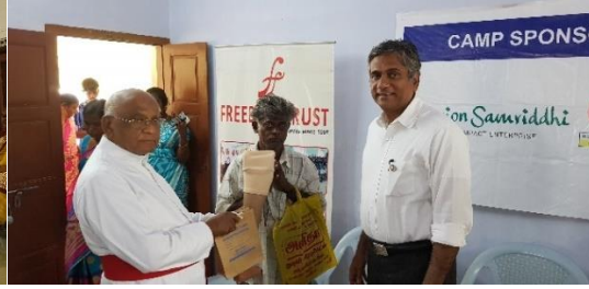
Eranielkonam – Mission Samridhi